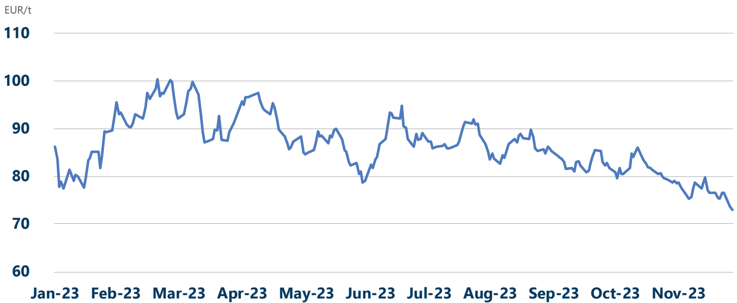
EU Allowances Price Trend in 2023

In November 2023, the EU carbon price experienced a 7.1% decrease, from €78.54 per tonne at the beginning of the month to €72.96 per tonne at the end. The average daily price for the month was €76.7 per tonne, down 5.92% from October and up 0.59% from November 2022.